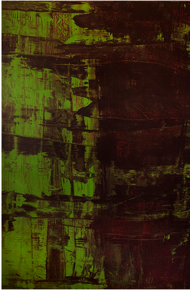
Jesse Mireles . Woodland 2017 . Acrylic on canvas . 72"x48"