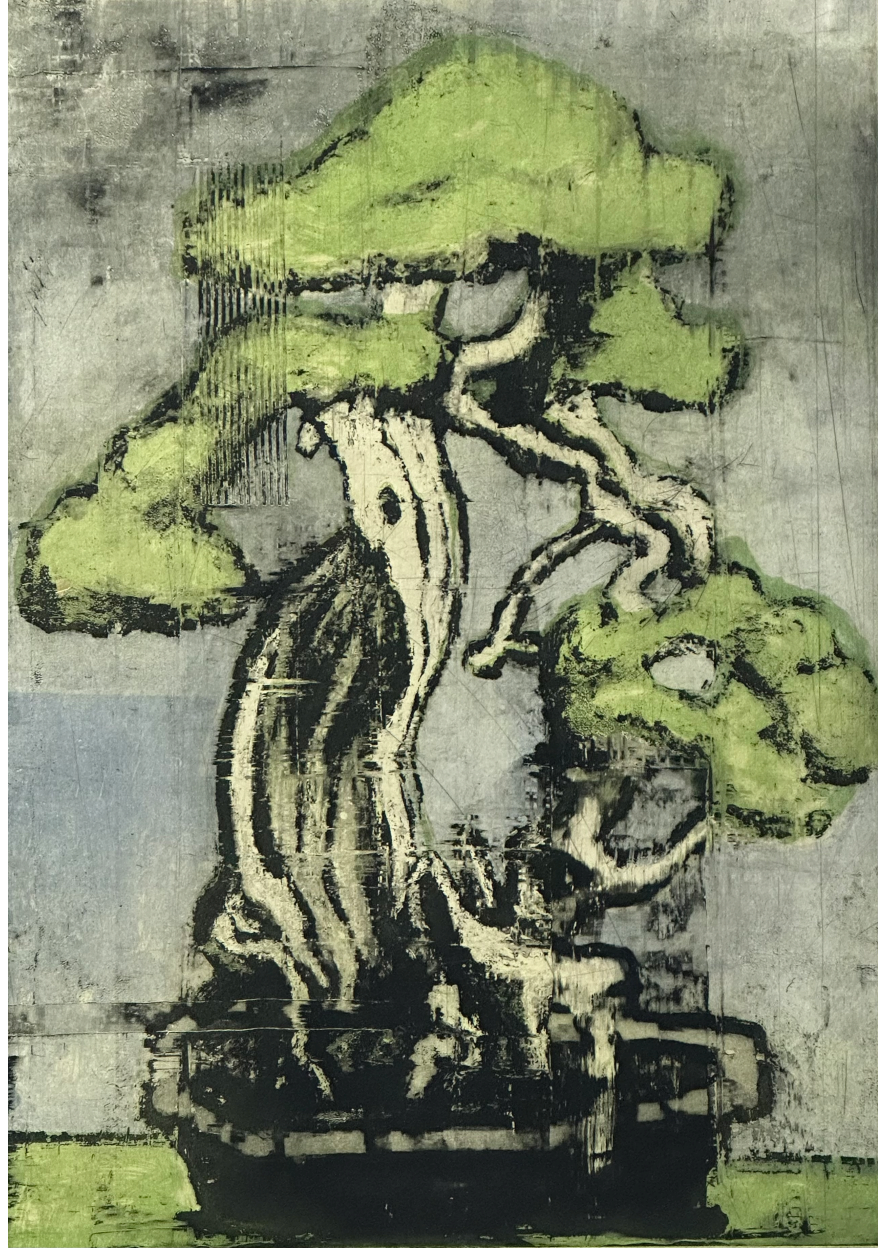
Aaron Fink . Bonsai #1 2016 . Unique Etching . 34" x 24"