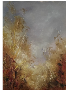
Laura Gettler Untitled 2023 Oil on canvas 12"x9"