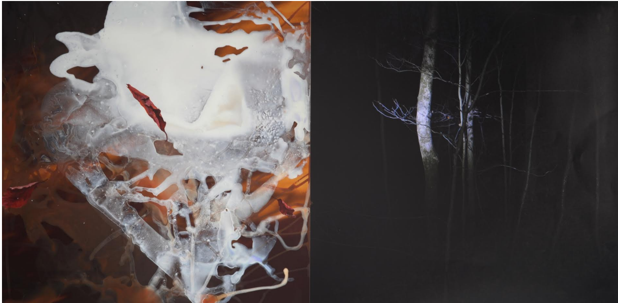
Michael Porter RWA . Untitled 2017 . Albers Foundation Residency . Oil and Acrylic Medium on photograph, and photograph . Diptych . each panel 16” x 16”

From the Founder: “ 400 Trees Gloucester combines natural history, environmental stewardship, hands-on education, and community participation to create a legacy for today and generations to come. Why trees? In addition to the beauty trees bring to a city, a neighborhood of trees can be 10° cooler in the warm months than a treeless one. Trees provide half the oxygen we breathe, and they absorb significant amounts of carbon which in turn decreases damage and disruption caused by climate change as well as providing additional services. “