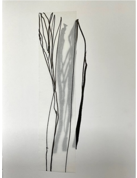
Celia Eldridge . Drawing from the Emerald Forest, One . 2017 Ink on 100% Rag Paper . 11 5/8"x8"