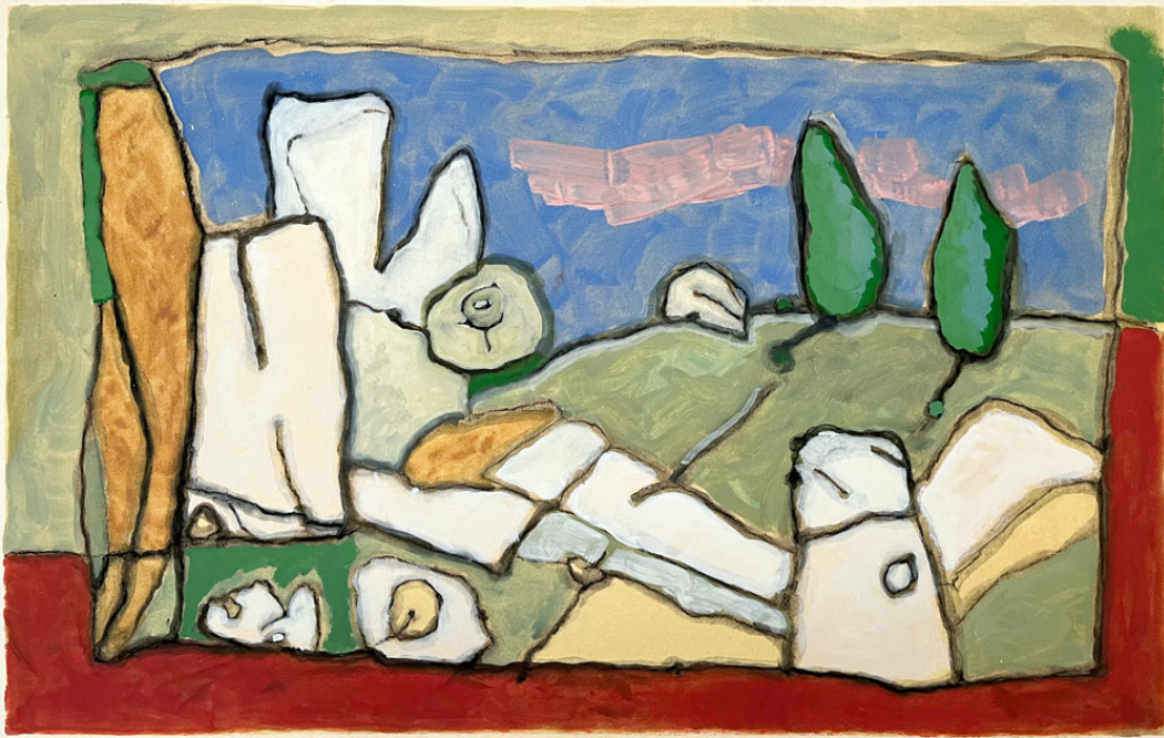
Untitled (undated) . Oil on paper . 23"x27" . Paper size: 25"x29"