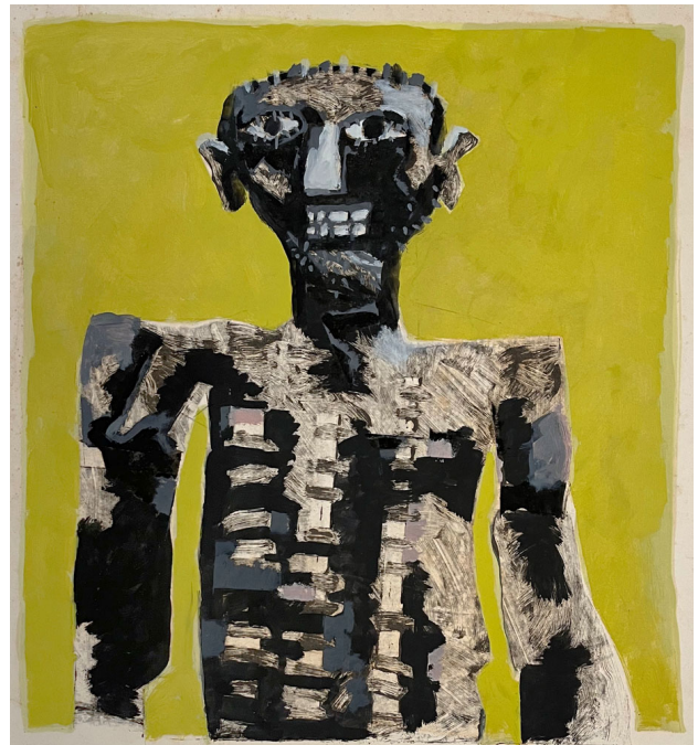
Untitled (undated) . Oil on paper . 22"x20" Paper size: 35"x23"

A selection of works from the exhibition can be viewed at: