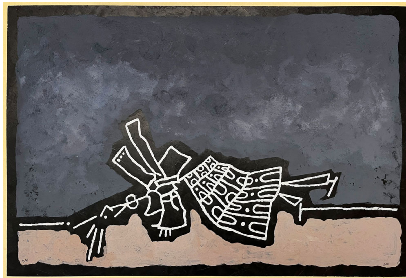
Untitled 2011 . Oil on paper . 18.5"x28" . Paper size: 22"x30"