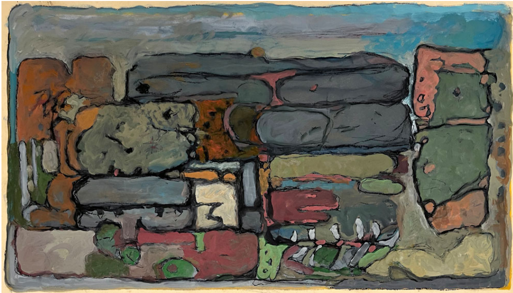
Untitled (undated) . Oil on paper . 20"x35" . Paper size: 21.5"x39"

Gallery hours: Friday & Saturday 1-5pm; Sunday 1-4pm and by appointment @ 978-879-6349 and 917-902-4359