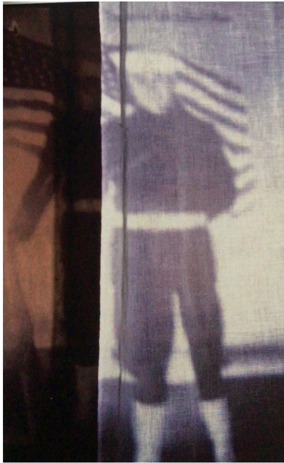
Above : Still from the video Then 2000-2003