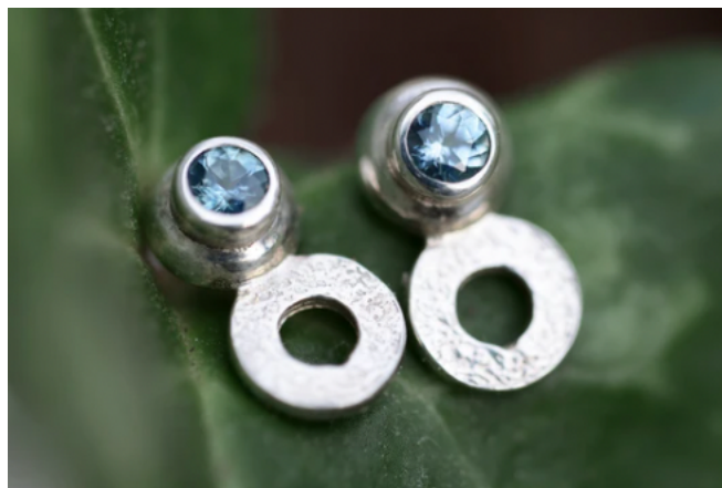
Chloe Leigh Modern Studs Silver and Sapphire