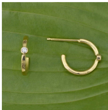
18K Diamond Hammered Huggie Hoops