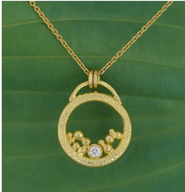
Chloe Leigh . 18K Sunrise Necklace with Diamond

"Growing up surrounded by the ocean landscape of Cape Ann, I find inspiration in the natural environment. My inspiration stems from the love of the sea and its complex habitat of plants and flowers. I'm drawn to circular forms, a warm palate, and hidden features that are often overlooked."