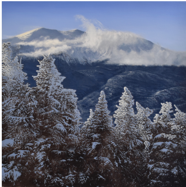
Late Afternoon, Mount Washington 2021 . Oil on canvas . 21 x 21 inches

The exhibition continues through August 29th. Gallery hours: Thursday 4-8pm . Friday & Saturday 1-5pm . Sunday 1-4pm and by appointment at 917-902-4359 . info@janedeeringgallery.com