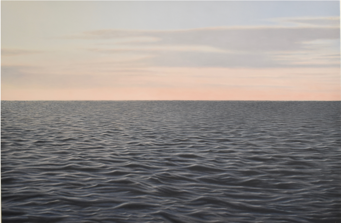
Boundless 2020 . Oil on canvas . 32 x 48 inches

The exhibition continues through August 29th. Gallery hours: Thursday 4-8pm . Friday & Saturday 1-5pm . Sunday 1-4pm and by appointment at 917-902-4359 . info@janedeeringgallery.com