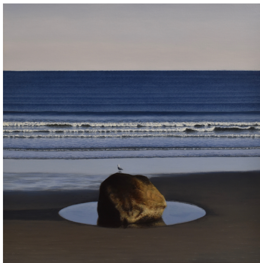
Rock Pool 2021 . Oil on canvas . 18 x 18 inches