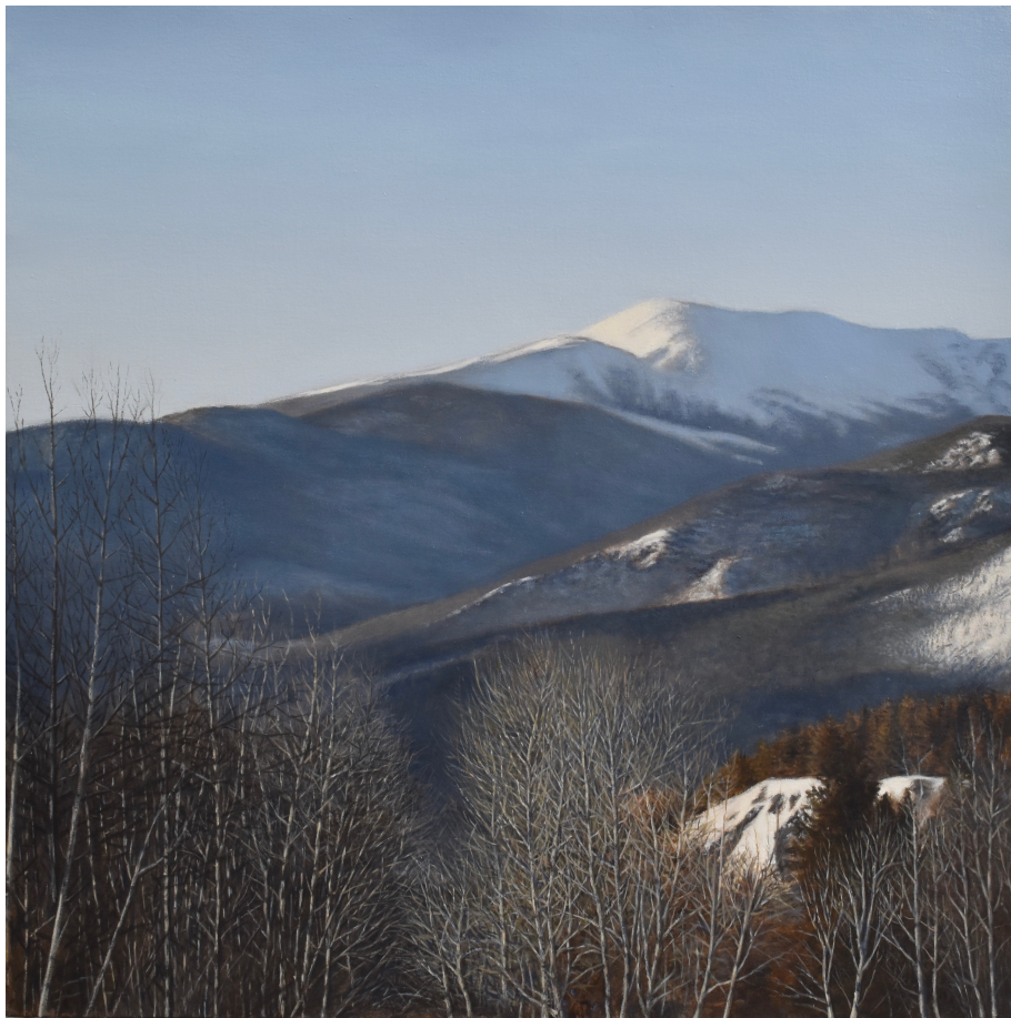
Evening, Mount Washington Valley 2021 . Oil on canvas . 21 x 21 inches