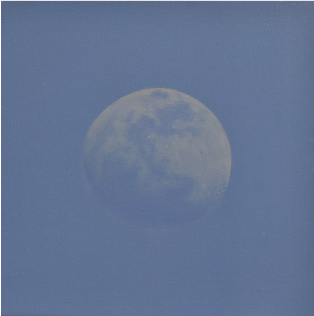
Portrait 1 2021 . Oil on canvas .10 x 10 inches