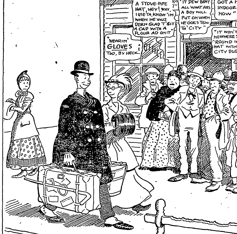
ARRIVING IN THE HOME TOWN WITH A SILK HAT BOX