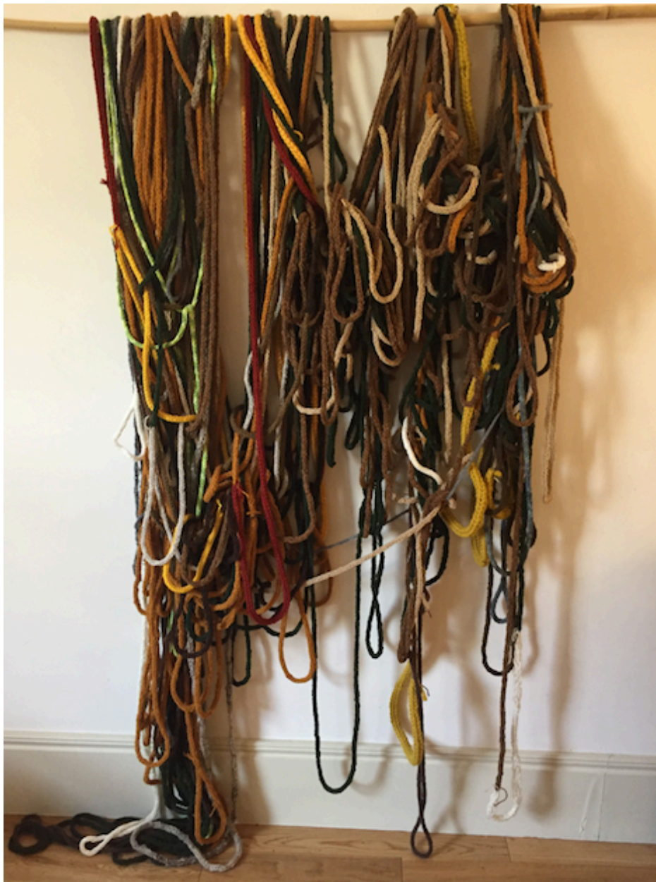
above: Landscape 2019 . Knitted yarn . Dimensions variable

I think the last adventure left on this planet is creativity; because we have been everywhere, there is not much left to explore, but there is exploration left in human imagination.